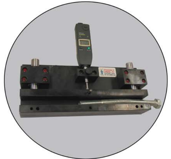
Step 2 - Bow of bolt turned to top of gage. Camber indicated on gage indicator.