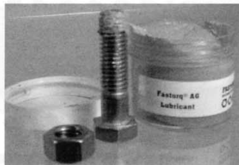
Anti-galling compound placed on bolt's end threads.

The threads of a 1/2-13 302 stainless steel bolt were severely damaged by striking them repeatedly with a hammer. It was reasonable to assume that a 302