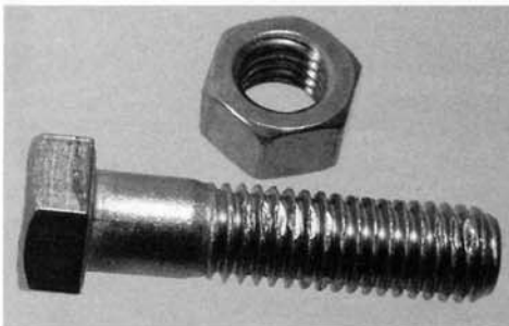
Stainless steel bolt with intentionally damaged threads.