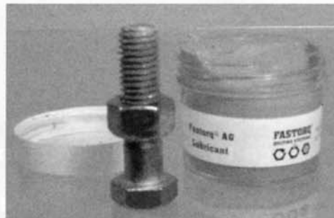
Nut goes entire length of bolt thread without seizing.